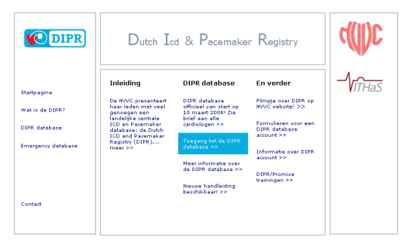
Figure 6: Screenshots of the DIPR homepage, with link to the DIPR database [4]

At the start the DIPR database has been filled with historical implant data from the SPRN registry (> 140.000 patients, > 180.000 device procedures, > 200.000 leads) [3].