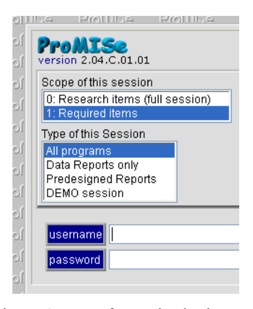
Figure 1: Part of Promise login screen

All NCDR databases are hosted by the 'ProMISe' system, developed by the department of Medical Statistics in Leiden, the Netherlands (see figure 1). ProMISe already hosts many other national and international scientific and clinical registries [1,2].