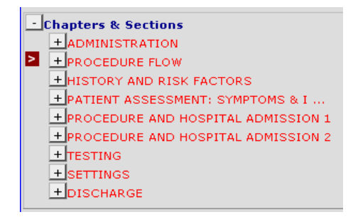
Figure 7: Screenshots of DIPR database sections.

Many hospitals are already entering pacemaker and ICD data on-line. Furthermore, a number of hospitals that have been using the local SPRN application (GRIT) will be facilitated so that they can still send their GRIT export files which then will be imported in the DIPR database.