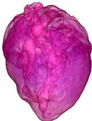
Fig. 3 Volume rendering of the sheep heart data.

Fig. 2 shows the (v, |\nabla f|) scatterplot created from the sheep heart data set. In the semi-automated design, we can further post-processing the histogram to edit the transfer function for better rendering. Finally, we show the volume rendering of the preprocessed data, as depicted in Fig. 3.