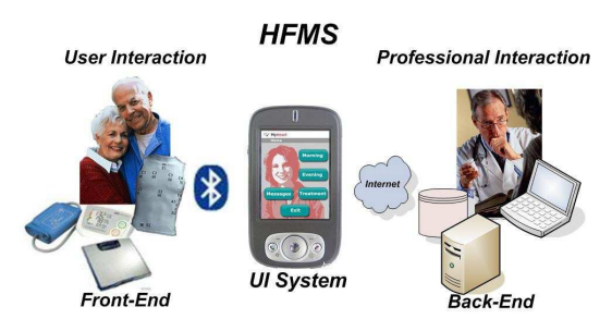
Fig. 1: HFMS overview

Heart Failure Management System consists of three main elements: a) The Front-end, b) the User Interaction System and c) the Back-end. The following figure sketches the global system: