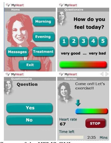
Fig. 3: Screen of the HFMS GUI

The Graphical User Interface follows the MyHeart Project common Look & Feel. Furthermore, it is userfriendly and intuitive, with clear indications of the necessary steps to follow during the monitoring sessions. Following figure shows the resulted GUI.