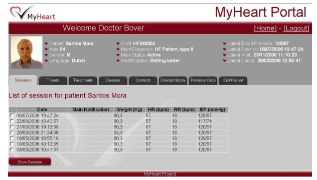
Fig. 4: Professional Interaction

The Professional interaction is based on a web access through the Cocoon Framework and a CFORM based visualization, as shown in the following figure: