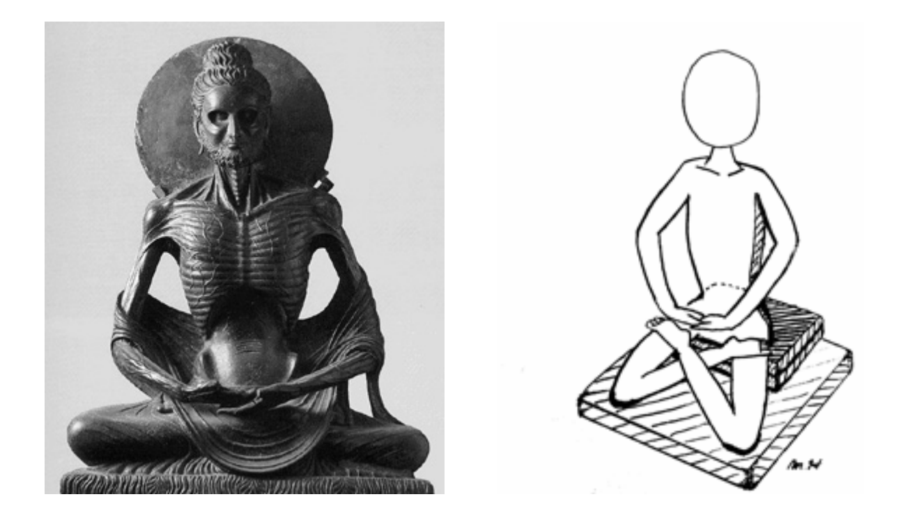
Figure 1. Bodily posture of Zazen. Left: Statue of Buddha, Right: Schematic representation of lotus position. See text.