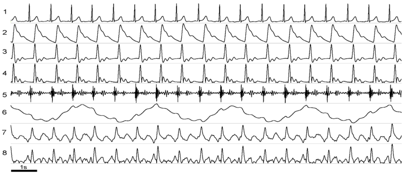
Figure 1. Measured and computed signals, from top: 1- ECG, 2-BP, 3- dBP/dt , 4- Abs dBP/dt , 5- heart sound, 6- TIC Zx, 7-dZx/dt, 8- Abs dZx/dt.

A head-up tilt table test (HUT) is usually performed to evaluate the causes of syncope (loss of consciousness). Vasovagal syncope (the most frequent syncope type) is related to an abnormal nervous system reflex causing the blood vessels dilatation [1]. When this happens the heart rate decrease, lowering of blood pressure (BP) and reduced amount of blood to the brain occur [2]. In case of noninvasive blood pressure measurements (photoplethysmography) [3] the blood pressure changes may reflect other artificial influences – blood perfusion, hydrostatic changes during tilting (unsuitable arm position), incorrect finger cuff application and device artifacts. All these factors can cause both dynamic and