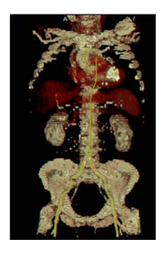
Figure 2. Three-dimensional volume rendering and the extracted vascular centerline (yellow curve).

In 1 training case and 2 testing cases, interaction was needed by the user to correct the centerline in the femoral artery. In the remaining 33 cases (91.7%), a fully-automated centerline was obtained with excellent results.