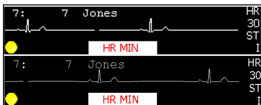
Figure 1: Traces on a QVGA (upper) and VGA (lower) device.

In QVGA (240x320, 96 dpi) equipped devices the resolution was halved (2 samples per pixel) to achieve an acceptable trace length. In devices with VGA (480x640, 192 dpi) displays the full resolution was kept (1 sample per pixel).