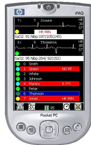
Figure 2: Layout in Portrait mode.

with alarms states of 8 (10 hiding the descriptive icons) patients at the same time.