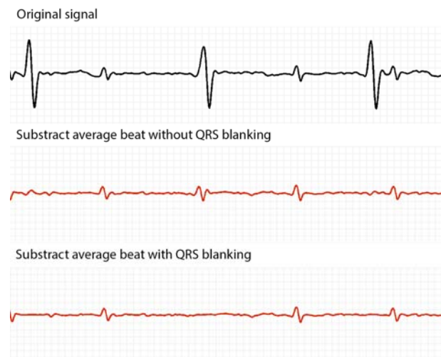
Figure 1. Signal a23 from the FECG Challenge Database (time resolution: 25mm/s). Top: Original Signal. Middle: signal after maternal QRS subtraction. Bottom: Maternal QRS blanking removes fQRS in case of coincidence.

To remove the predominant maternal ECG the averaged maternal beat had to be determined first. The averaged beat was then subtracted from the original signal and two new signals (averaged beat subtraction with and without maternal QRS blanking) were created as described in [6].