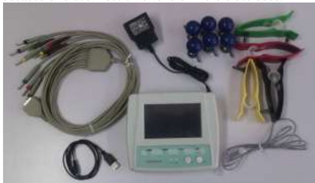
Figure 1. The Recorder and its accessories.

The ECG amplifier includes an analog band pass filter to limit the signal frequency spectrum between 0.05 and 100 Hz, according to the IEC 60601-2-25 standard [2]. Circuits connected directly to the patient are protected against defibrillator discharge through 10 kΩ resistors and includes the classic right-leg circuit to improve the common mode rejection ratio [3]. The detection of pacemaker spikes is based on lead II analysis; the signal at the output of the instrumentation amplifier is passed through a filter that isolates the peaks and set an output digital pulse each time identifies one of these events. Furthermore, a trace recover circuit was implemented to recover the baseline level when amplifiers are saturated because of disconnection of one or more electrodes.