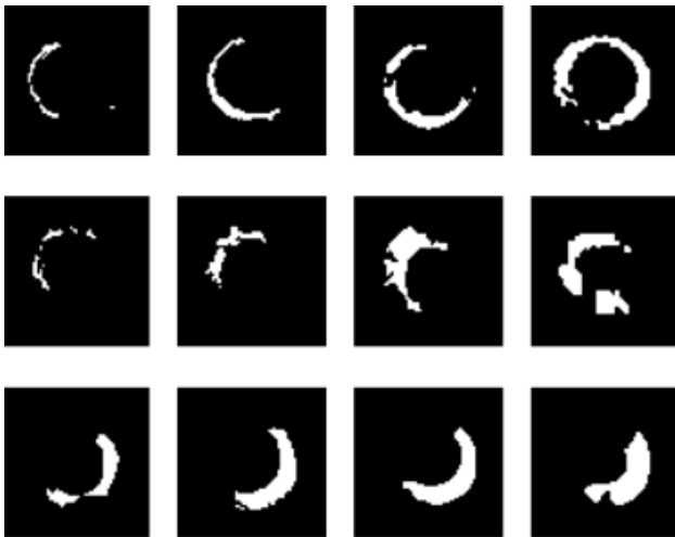
Fig. 2: Examples of scar masks obtained with manual tracing. Each row refers to a different patient. Masks are from apex (left) to base (right).

Inspired by these recent methodologies, the aim of this work was to assess quantitatively the presence of scar tissue in CMR-LGE images using a DL approach based on FCNNs.