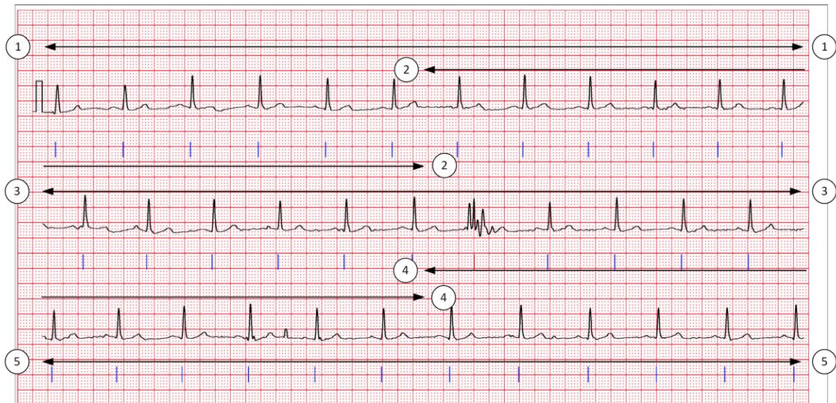
Figure 2. 30s single lead recording divided into 5 segments each of 10s labelled 1 - 5. Noise can be seen at around 16s.

Heart Rate: 68 bpm Interpretation: Sinus rhythm with PVC(s) Category: Normal Truth: Normal