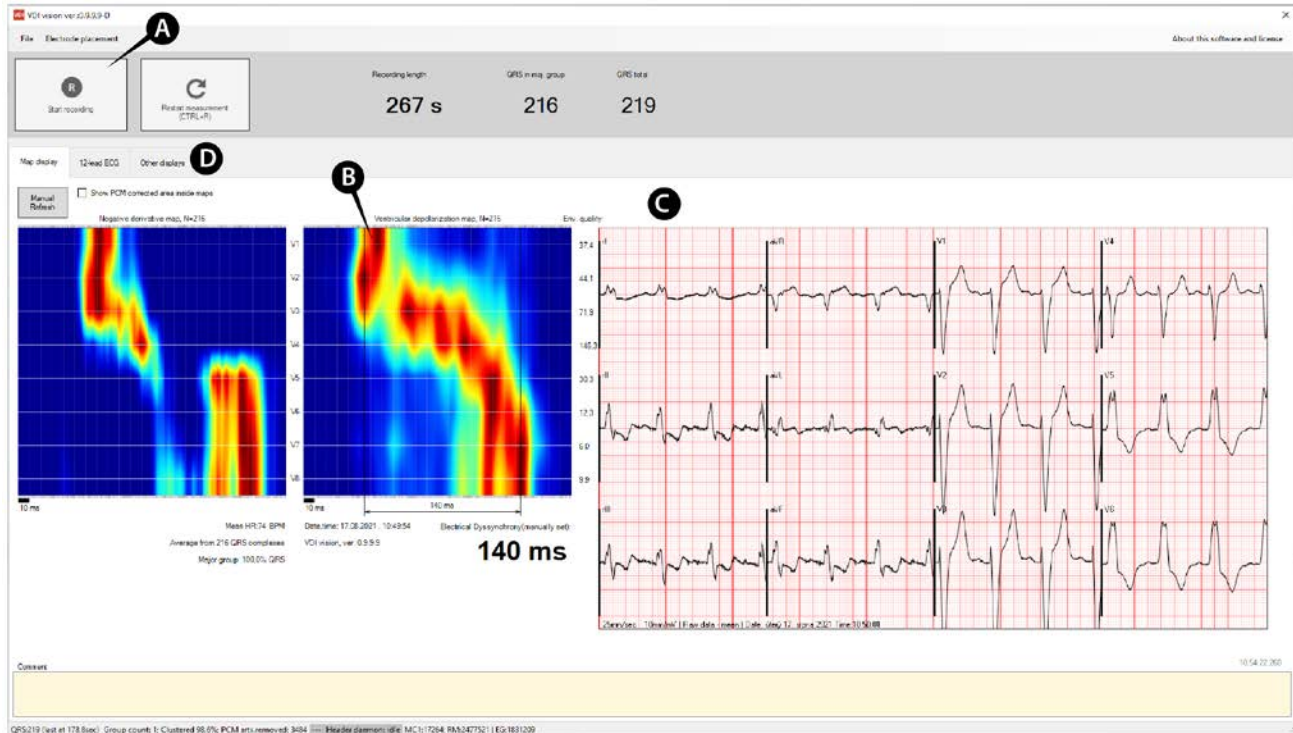
Figure 1 – The VDI vision software graphical user interface when the measurement is finished. When a new measurement is started (A), the Ventricular Depolarization map (B) is instantly updated whenever a new QRS complex is detected in the incoming ECG signal (C). Internal processes may be further checked using other display modes (D).