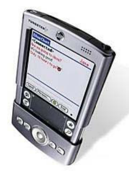
Figure 1. Palm Tungsten T, as used in our department

We have chosen to provide all staff members and residents at the department of Cardiology with a Palm Tungsten-T Personal Digital Assistant (PDA) (see Figure 1).