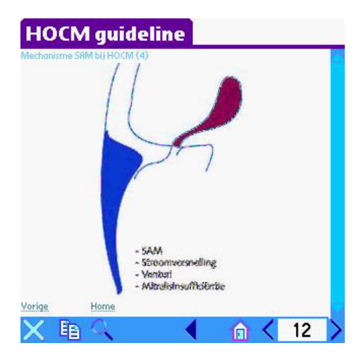
Figure 5. Example of the guidelines graphical possibilities.