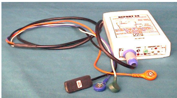
Fig. 1. Picture of the 24-hour cardiorespiratory recorder used in the study (Report-24, FM, Monza, Italy).

To record cardiorespiratory signals we used a Holter-style 24-hour solid-state portable device (Report-24, FM, Monza, Italy). This recorder is suitable to be easily handled by the patient at home since only 3 ECG electrodes are used to pick-up both the ECG signal (single lead) and the respiratory signal (bio-impedance technique), while a small plastic box houses the body movement and position sensors (figure 1). Sampling frequency was 250 Hz for ECG, 10 Hz for respiration and 1 Hz for the movement and position signals.