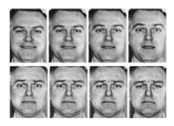
Figure 2. Example of emotional faces. The two rows of this illustration contain morphed continua ranging between happiness – surprise (top), fear – sadness (bottom).